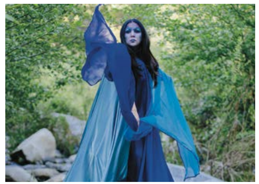
Courtesy of the American Indian Prison Project Working Group at their Salmon Woman Benefit Performance

works to build the capacity of community-based organizations through grants, training and other resources as partners in the human rights and social justice movements. As a public foundation, we nourish, foster and encourage the diverse, self-sustaining and economically viable communities that are essential to building a peaceful, just and equitable world.