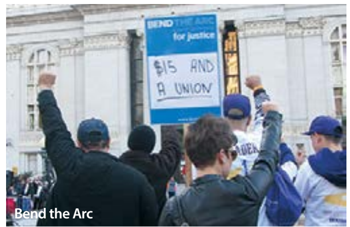
Bend the Arc

PDF's Donor Advised Funds program has been recognized by Forbes Magazine : "How to Find the Right Donor Advised Fund (and Why)."