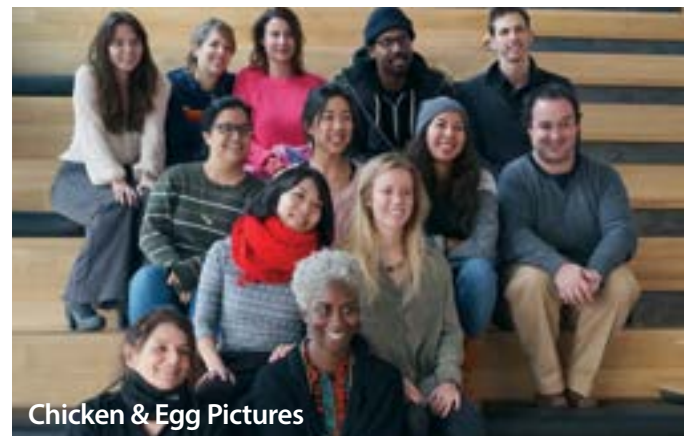
Chicken & Egg Pictures