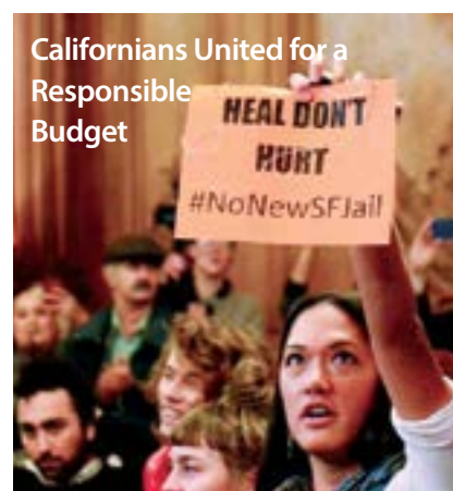
Californians United for a Responsible Budget