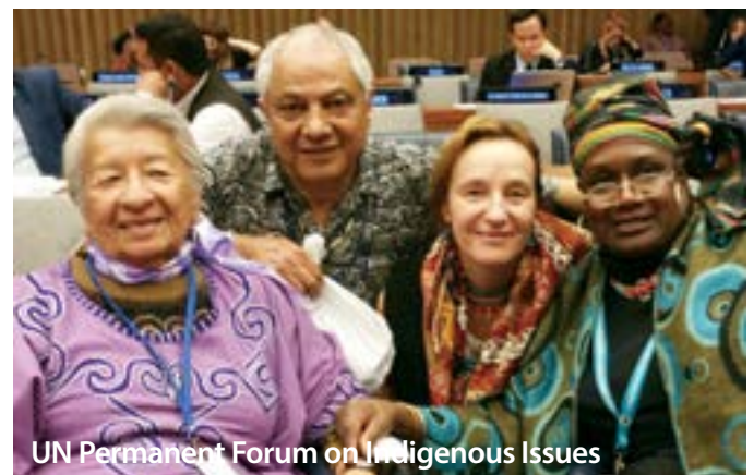
UN Permanent Forum on Indigenous Issues