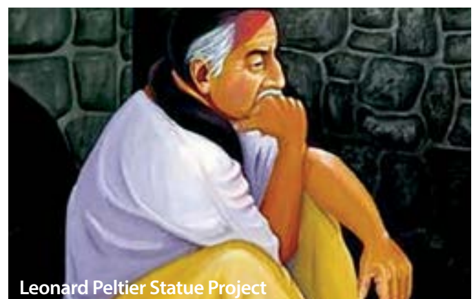
Leonard Peltier Statue Project