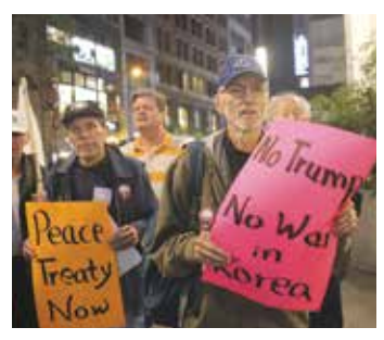
Zoom in Korea