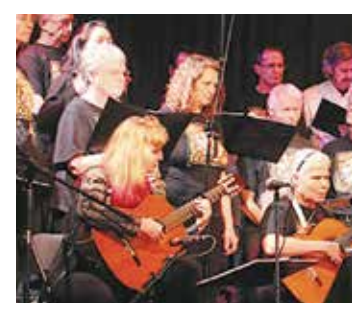
La Peña Cultural Center