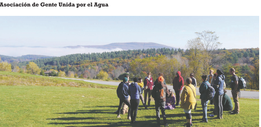
Out in The Open