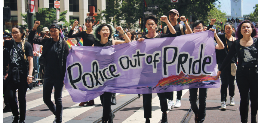
API Equality – Northern California