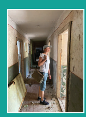
Project Nadiya Ukrainian rehousing

Women's International League for Peace and Freedom