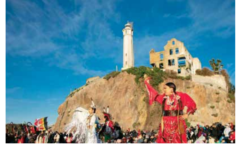
Restoring Justice for Indigenous Peoples