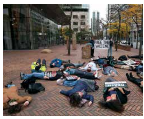
Washington Fair Trade

inequalities are leading organizers and communities in big cities and small towns to take action to imagine a different economic future centered on justice, equity, and a world where opportunity is not confined to a privileged few.