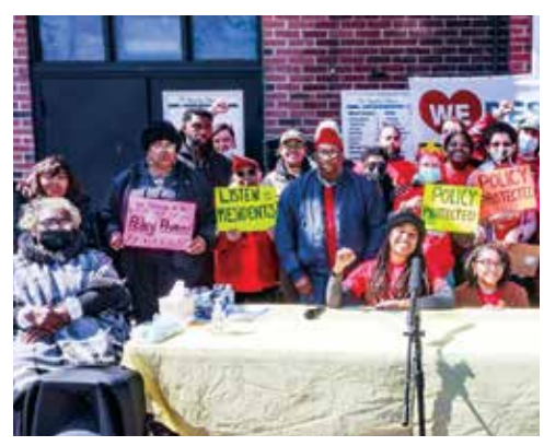
Root Cause Research Center

alliance, bringing together labor unions, community organizations, environmental groups, and various activist voices. United in their fight against economic inequality, they have focused on key initiatives that resonate across their broad membership. Their initiatives this year are focused on seminal trade negotiations in Seattle, which will impact jobs, wages, labor rights, climate action, and consumer privacy. Their community organizing work will include an educational webinar in partnership with the UW Department of Global Health, a series of educational panels tar-